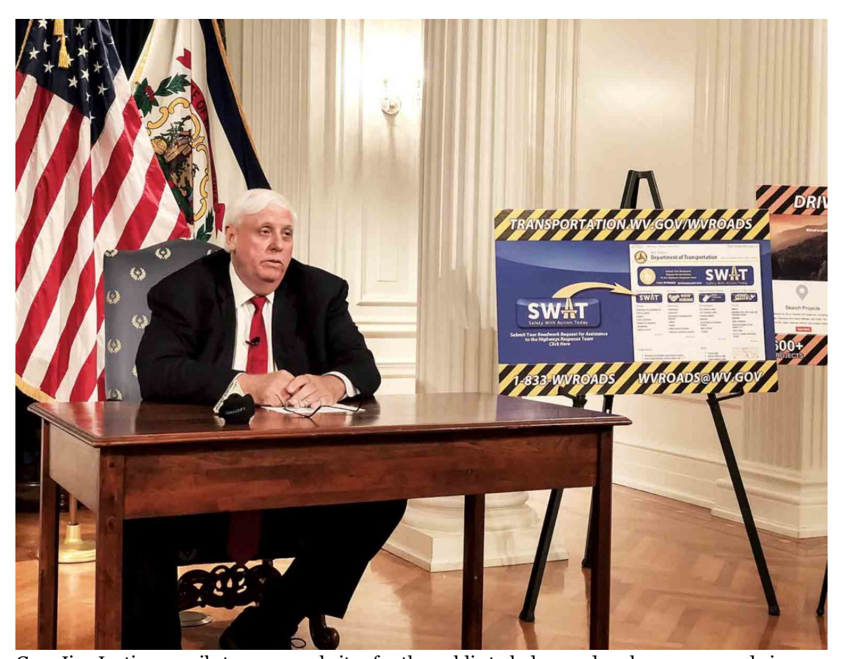
Gov. Jim Justice unveils two new websites for the public to lodge roadwork concerns and view progress on Roads to Transparency projects.

CHARLESTON – State officials hope two new websites help give the public more oversight of road construction projects and a voice in